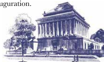
The House of the Temple